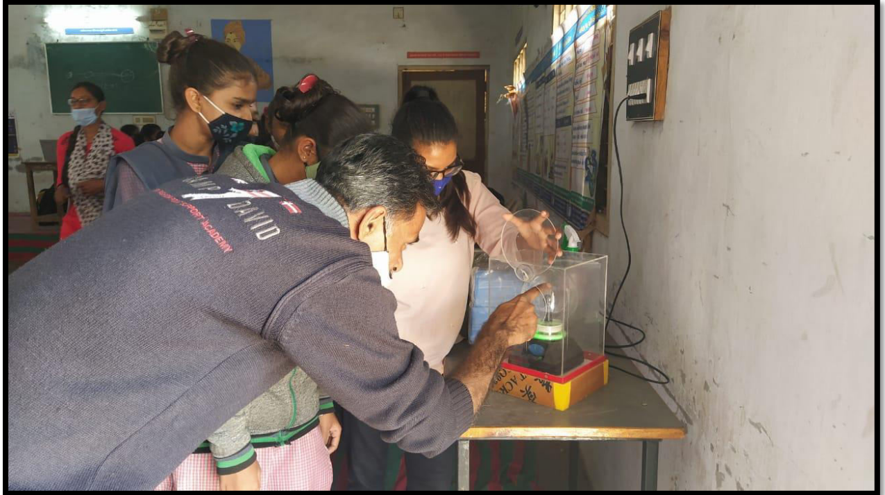
Model Demonstration & Explanation