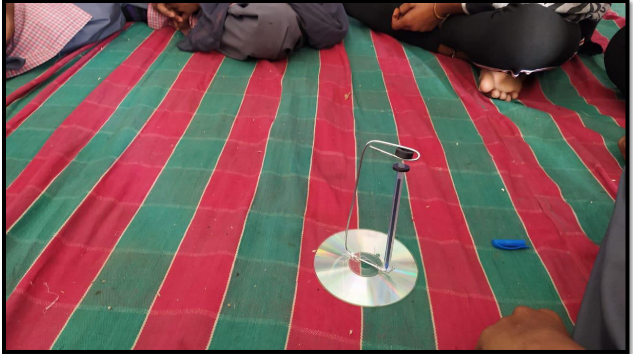
Creative Learning Session